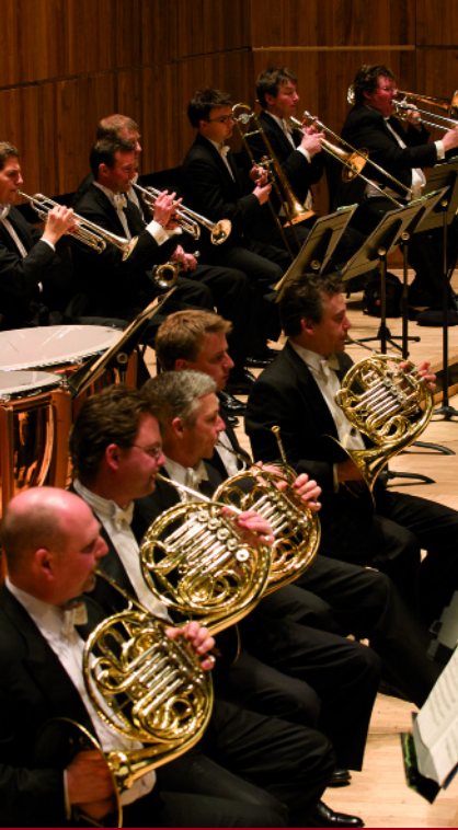
Royal Philharmonic Orchestra